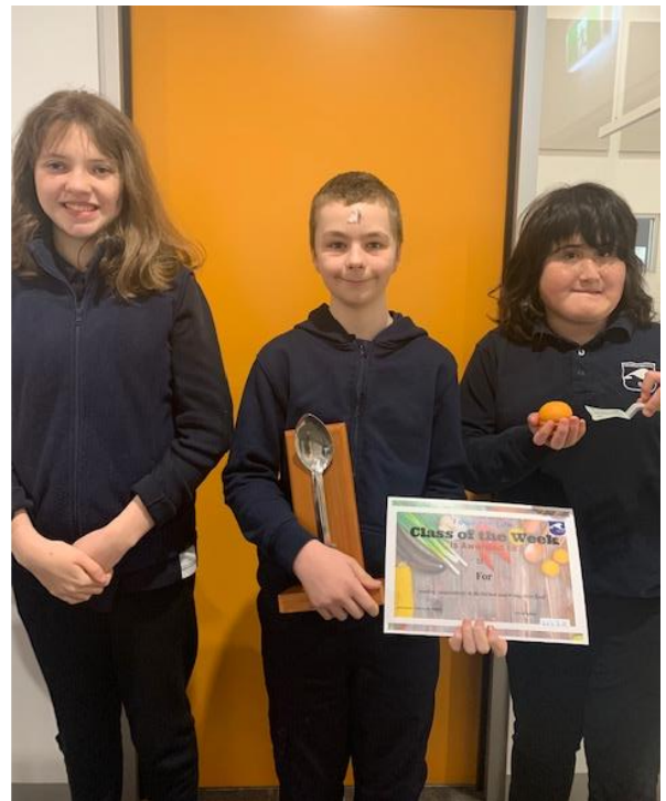
S1 received the Food For Life award for working cooperatively in the kitchen and trying their food.